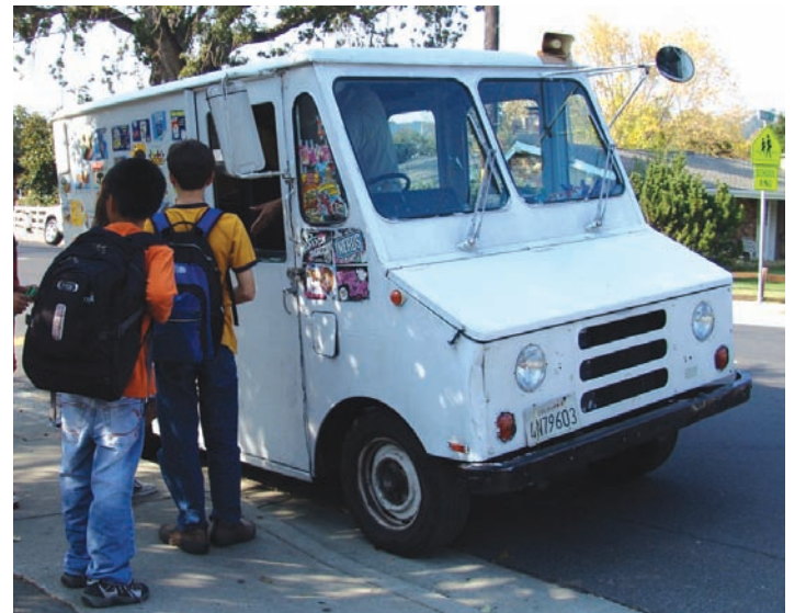
The ice cream man on School Street in Lafayette

The ice cream man truck industry has changed quite a bit since my day. When we heard the tinny rendition of...what was that song? We ran into the house, begged for a few quarters and the chase was on for blocks. I balanced one sister on the back of my banana seat and another on the handlebars...look Ma no helmets! I braved busy streets and honking horns. I fought for my cream. The ice cream man? Well his job was rough too. He would drive fast then slow masterfully playing his funky tunes. He worked 'til dusk- he worked hard for the money.