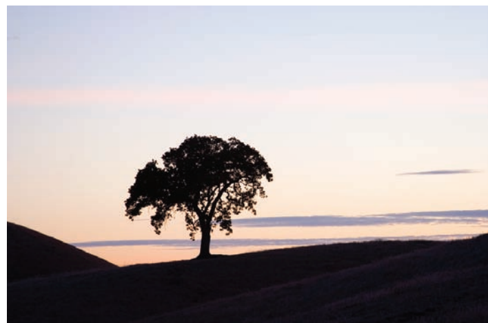
Valley Oak & Horizontal Clouds Shell Ridge

It hits me as I walk home, at the rate we're going, will there soon be a mandate on ice cream sales in proximity to schools? I enjoyed cookie sales at school as a child and now we get wrapping paper and magazine fundraisers? Next thing I know we'll be selling food recycling buckets for your waste when someone becomes tuned in to the fact that we're peddling paper. Halloween is not the only opportunity to be a kid around here; it's comforting to see some of these symbols of our childhood are still around.