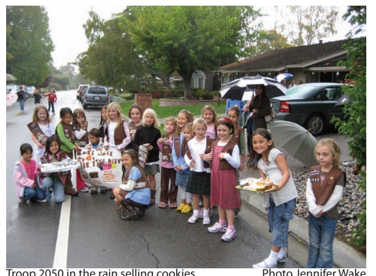
Troop 2050 in the rain selling cookies

Girl Scout Troop 2050, along with two other troops from Burton Valley Elementary School in Lafayette, moved their bake sale to a drier location on Monday, Oct. 15 as rained sprinkled onto plates of cupcakes and cookies. Undaunted, the girls continued to call out to passing drivers who stopped for some treats. The sale was organized after the Troops learned about the fire at Deer Hill Ranch, where they had gone on a field trip last year. All proceeds from their sale went to the Ranch.