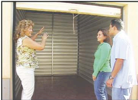
We can help you get organized to get more room at home, in your office or your garage!