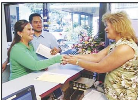
Convenient storage makes it easy!

NOW rent or make payments EAST...use 5A's convenient paystations, pay at the gate, or on-line www.5Aspace.com