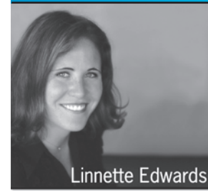
My Housing Guide founder & Assoc. Broker with Prudential Orinda. Top Producer featured in Wall St Journal.