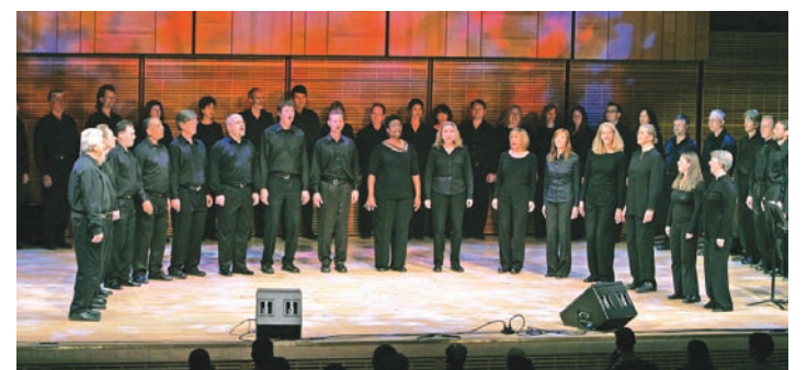
Pacific Mozart Ensemble

A Musical Celebration for Christmas featuring the Pacific Mozart Ensemble Performing works from Mozart to Stravinsky to Dave Brubeck, this stun-