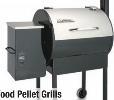
Traeger Wood Pellet Grills