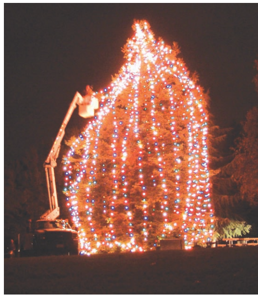
The Town tree lights go up

The Moraga Town Council has granted the Town's holiday tree, a 60 foot pine in the center of the Moraga Commons, one more year of lights.