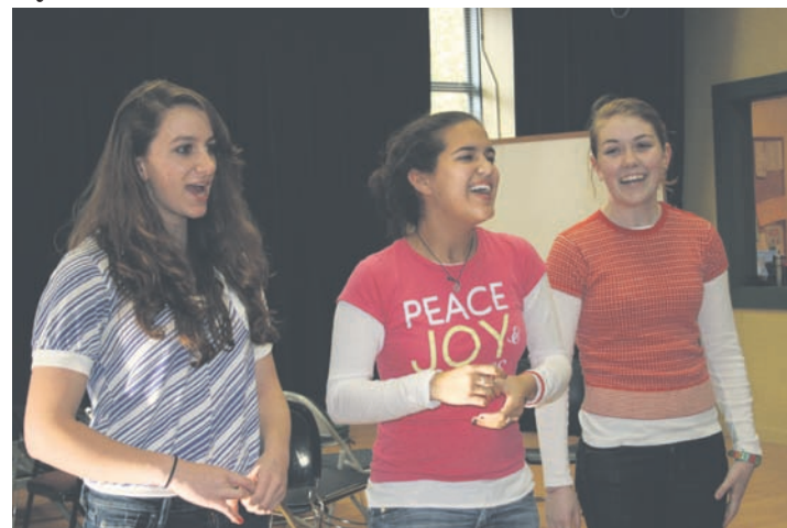
Members of the Bentley singing ensemble the Shallow Soles rehearse for the upcoming production of Sherman's Lagoon The Musical