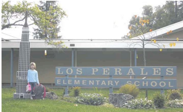
Work on the State Building, Los Perales. Empire State Building for the

As of this writing no arrests have been made, but some parents and staff believe the recent vandalism was probably the