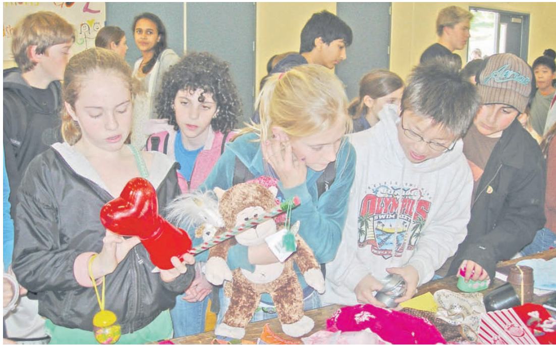
OIS students at the Bargain Mart