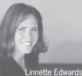
My Housing Guide founder & Assoc. Broker with Prudential Orinda. Top Producer featured in Wall St Journal.