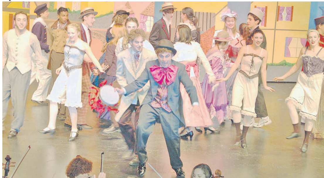
Acalanes students perform The Mystery of Edwin Drood