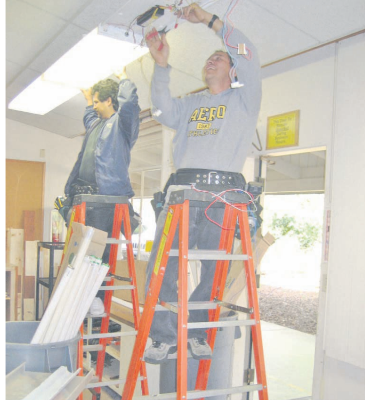
Workers installing more energy efficient lights