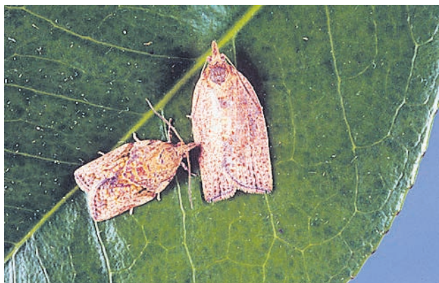
Adult moth and the larvae