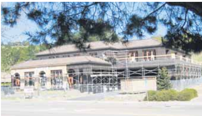
Professional condominiums nearing completion on Moraga Road

Each suite will be customized according to clients’ requirements. Not only the finishes but also the inside layout will be customized, since, for example, a medical office may have different requirements than a law practice. Two suites have already been sold and other potential buyers are entering negotiation.