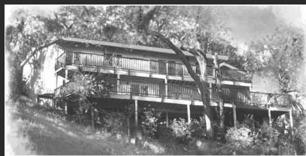
3398 Ridge Road, Lafayette