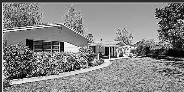
614 Lucas Drive, Lafayette