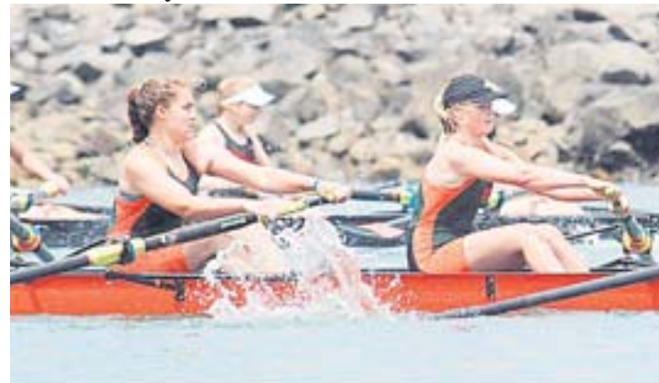
Varsity 8 racing

On June 13th, 13 Lamorinda athletes will head to Cincinnati, Ohio with the Oakland Strokes to compete for a national championship title at the USRowing Youth National Championship Regatta. The Oakland Strokes, a youth rowing club that rows out of the Oakland Estuary, qualified four crews for this prestigious event. The women's varsity 8+, women's lightweight 8+ (all rowers under 130 lbs.), men's varsity 4+, and men's lightweight 4+ (all rowers under 155 lbs.) qualified by placing in the top three in their events at the USRowing Southwest Junior Championship in May.