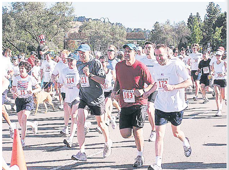
2007 4th of July race

The MOFD has also issued its traditional annual warning: Fireworks may be canceled up to 15 minutes before the show, if conditions mandate. This hasn't happened yet, so let's hope that the unprecedented dryness of the vegetation this year will not lead to a big disappointment for the thousands of viewers expected to attend the display.