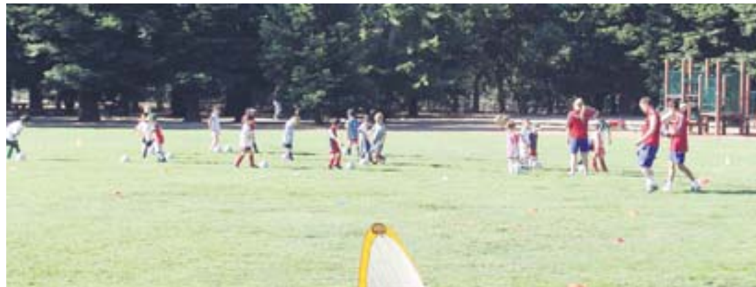
Dogs take the sidelines while kids use the field at Rancho Laguna