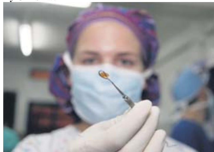
A nurse holds a cataract