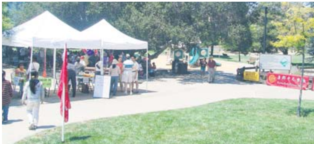
Contra Costa Chinese School hosted a barbecue picnic at the Moraga Commons

The Contra Costa Chinese School, which was founded by a small group of Chinese parents who wanted to provide Chinese language instruction to their American-born children, hosted a barbecue picnic last July at the Moraga Commons.