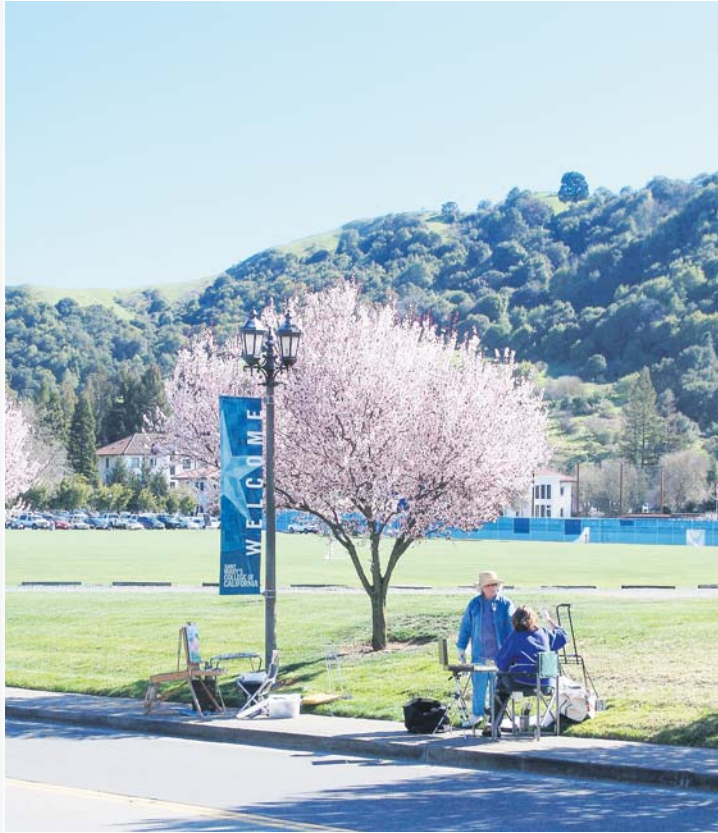
Pam Glover with a student