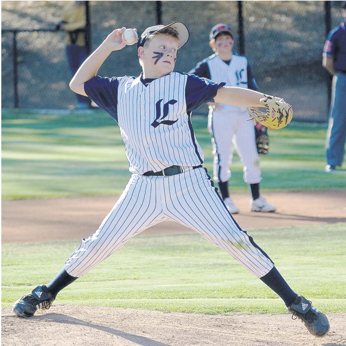
All Star Pitcher