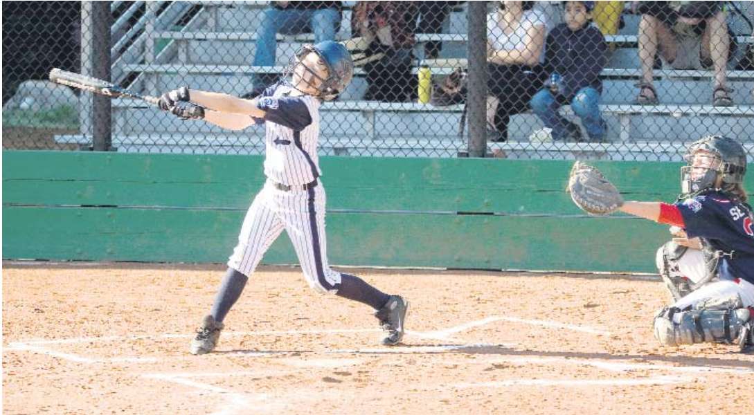
Little League All Star play Albany