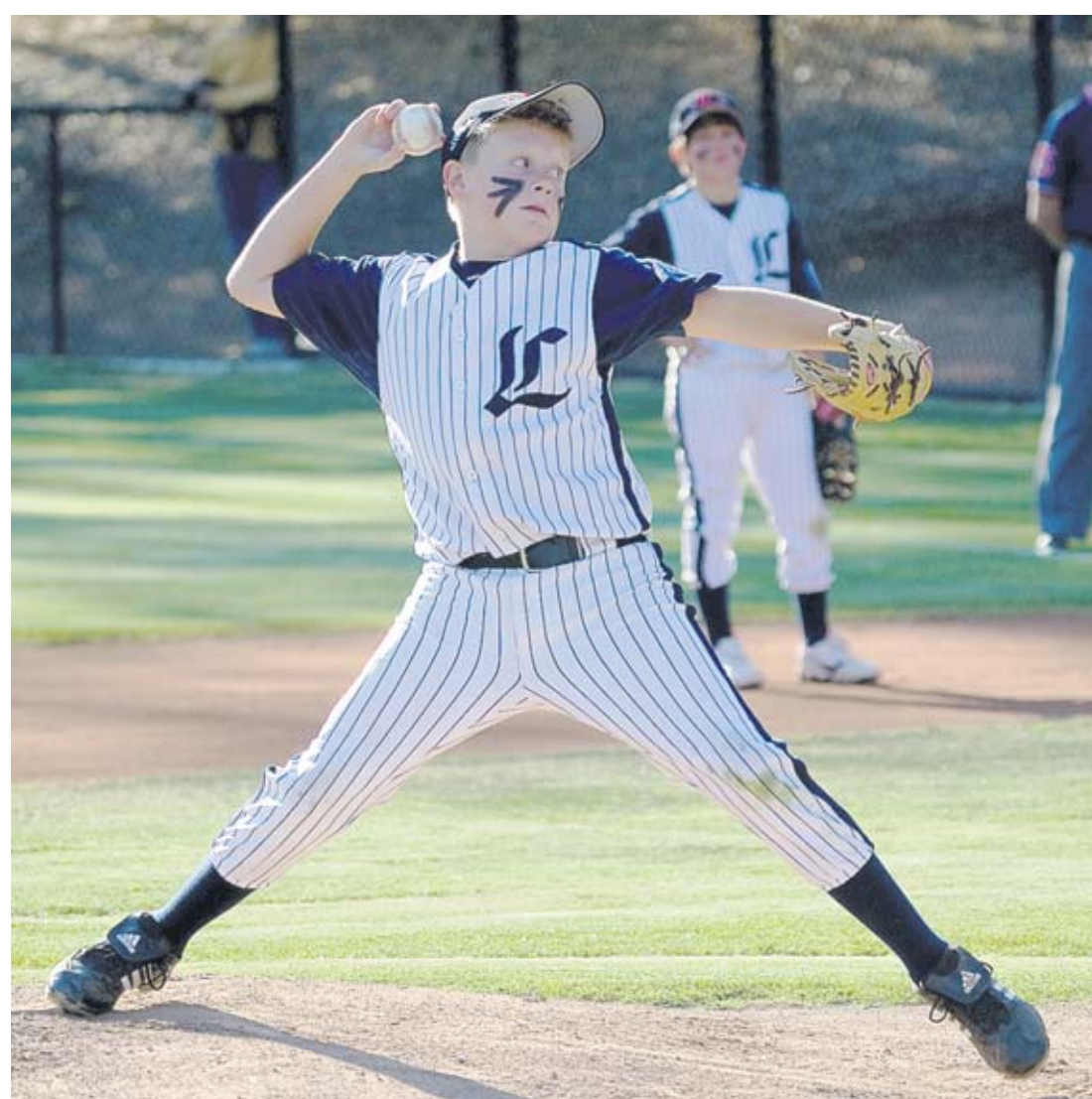
All Star Pitcher