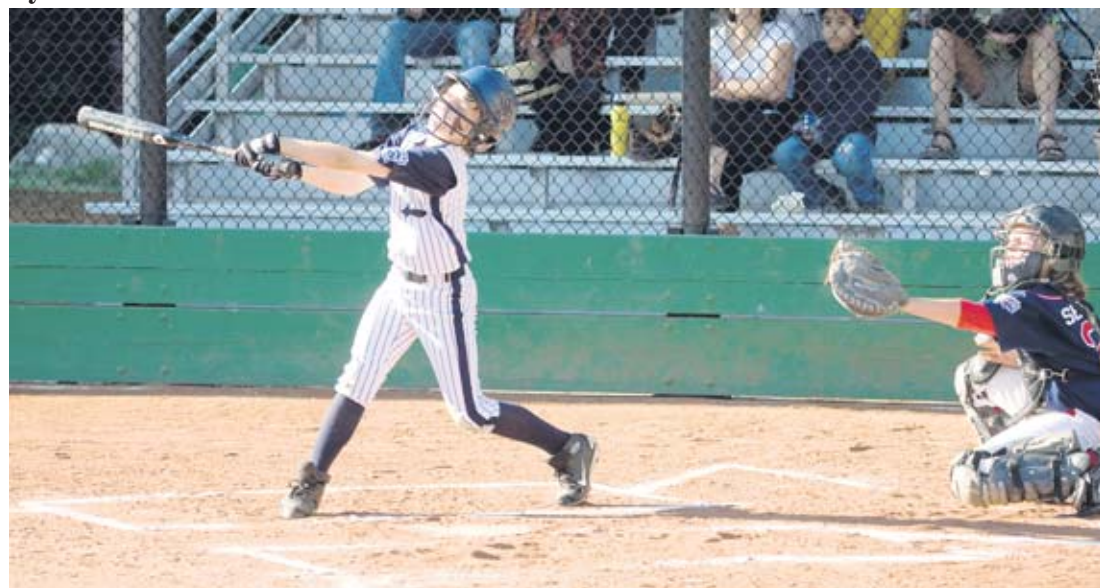
Little League All Star play Albany