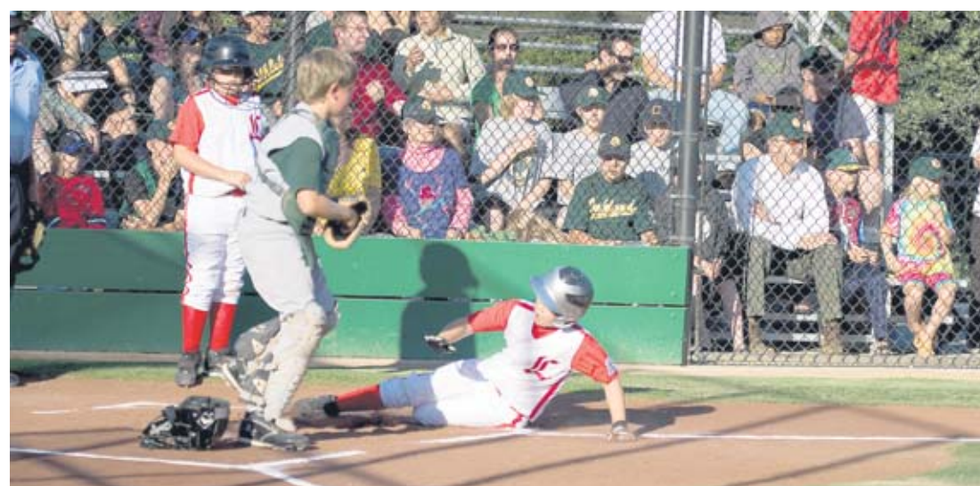
Little League All Star play North Oakland