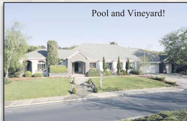
Pool and Vineyard!

Great home for entertaining! Updated with over 2700 sqft and a 3 car garage. All on a .36 ac. lot with lap pool, patios, lawn and mature Sangiovese vineyard. OFFERED AT $1,435,000 www.11sandersranchrd.com OPEN SUNDAY 1-4