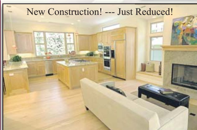
New Construction! --- Just Reduced!