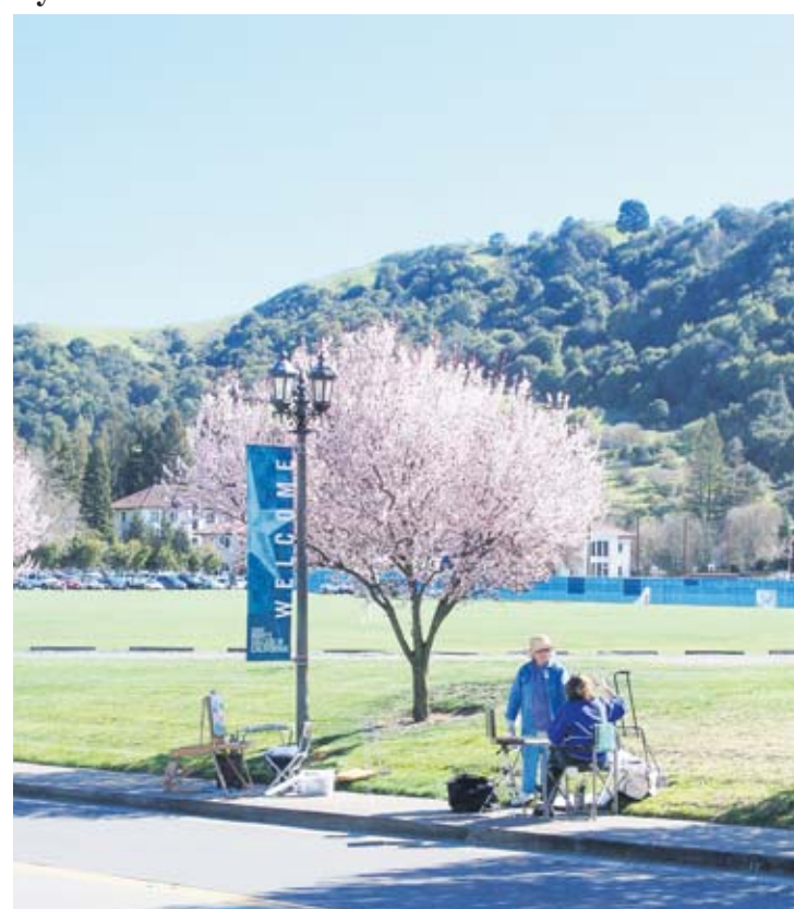
Pam Glover with a student