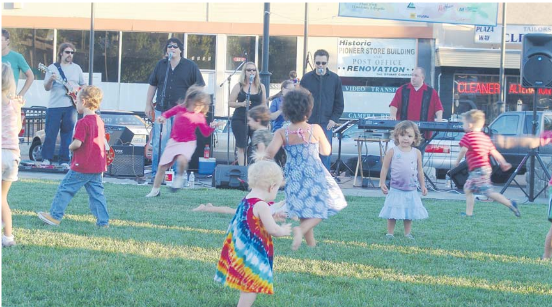
Rock the Plaza 2007

Pack your own picnic or just pick up some delicious food and drink at the park, on the corner of Mt. Diablo Boulevard and Moraga Road. Come as you are, dancing shoes optional. What could more fun than savoring an adult beverage with pals, your toes in the grass on a warm summer night? Carpe the Friday.