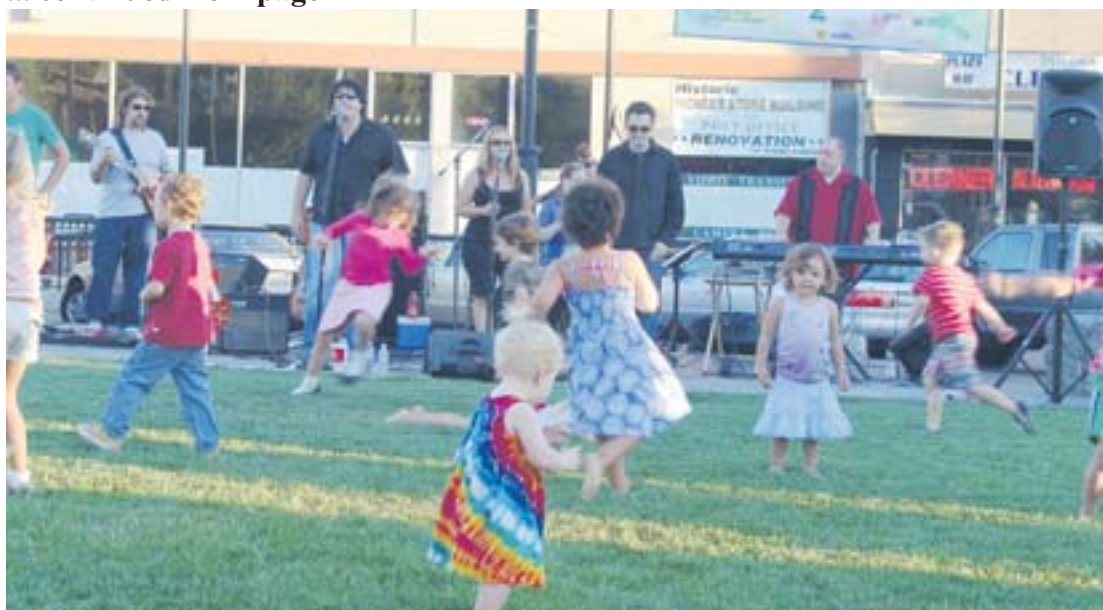
Rock the Plaza 2007