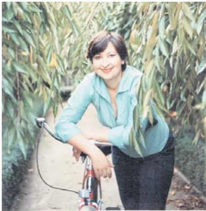
Author Firoozeh Dumas