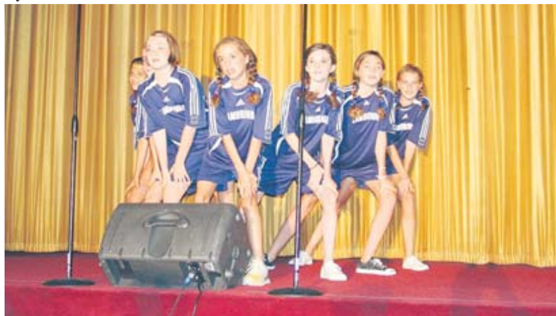
Lamorinda Blue, Soccer team United 95