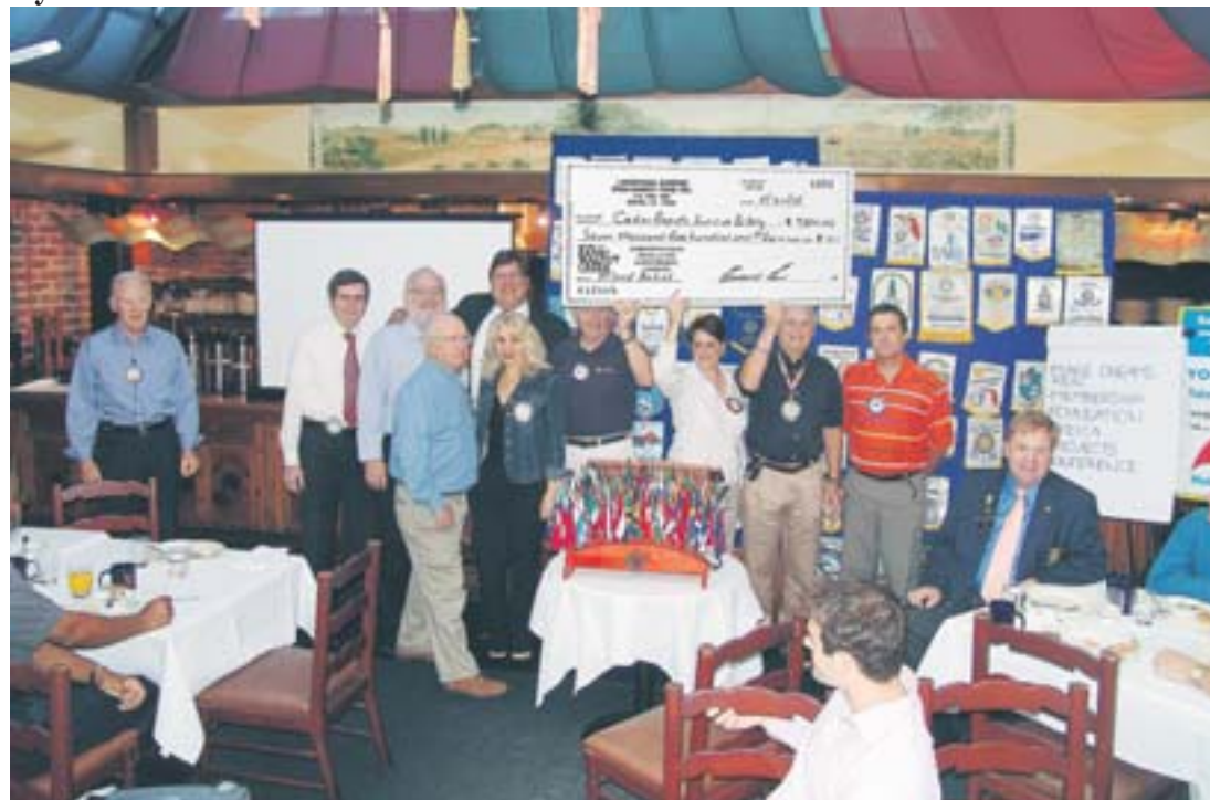
Sunrise Rotary members present the “Check” at the meeting on August 22nd