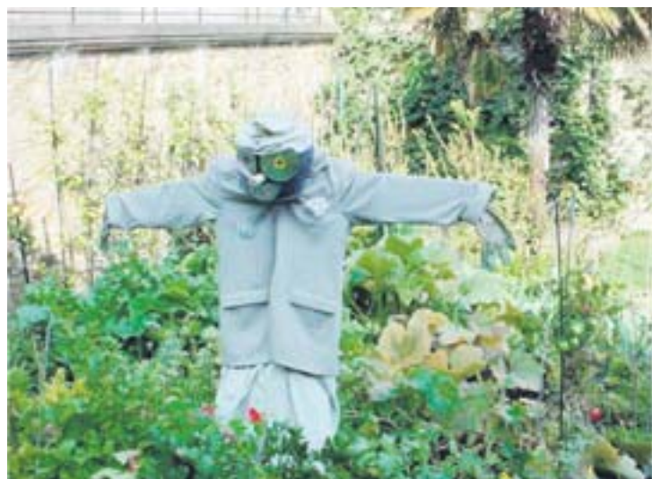
Non-toxic creative protection