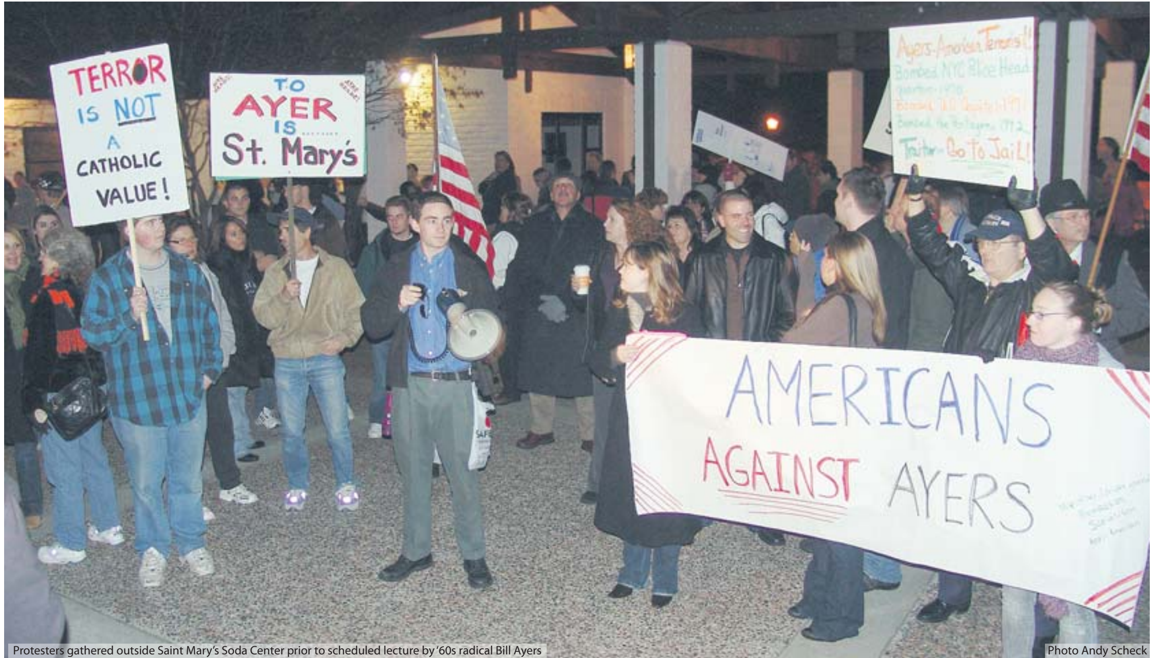
Protesters gathered outside Saint Mary's Soda Center prior to scheduled lecture by '60s radical Bill Ayers