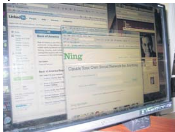
Social and professional networking sites