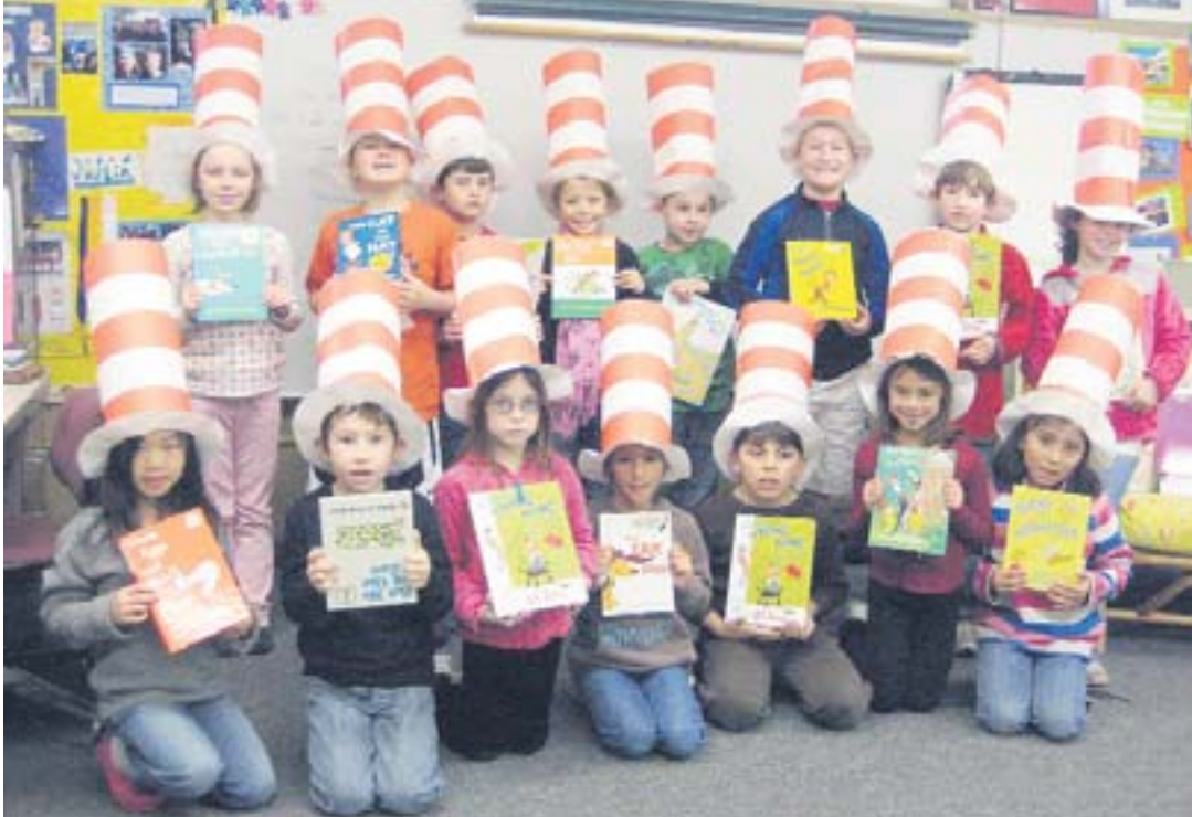
Sleepy Hollow School second graders ready to read

Por elementary students in Lamorinda, the first week of March brought a birthday celebration. Instead of cake, however, students devoured books. Party favors came in the form of funny words