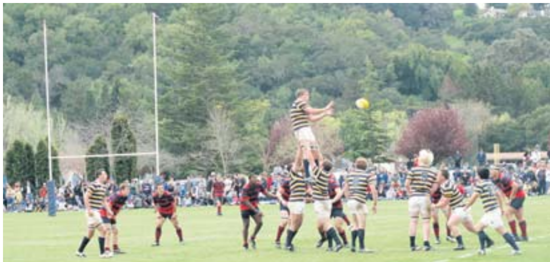
Cal dominating the line out

The fans of Saint Mary's and Cal were treated to something special in Moraga on Saturday, March 21, as the third ranked Gaels hosted the number one ranked Cal Bears rugby squad. Both teams came into this game undefeated, with the Bears boasting a 25-0 record, and the Gaels carrying a 17-0-1 record.