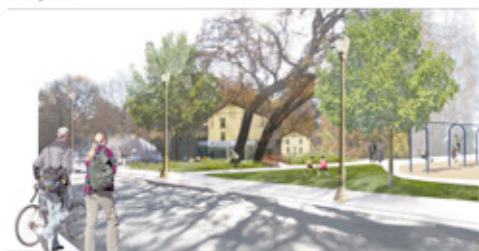
New Parks Conceptual rendering of a new "Town Green" in the Shield Block.