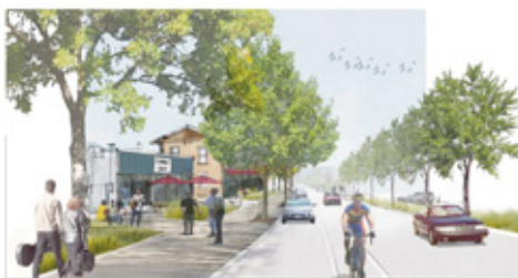
Mt Diablo Boulevard Beautification Conceptual rendering of Mt Diablo Boulevard improvements on the East End.