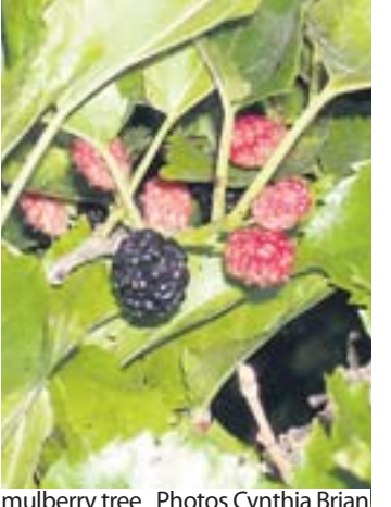
mulberry tree

and protectors. Question: You've written about the fruit on your mulberry trees. I've only heard of fruitless mulberries. Can you tell us more?