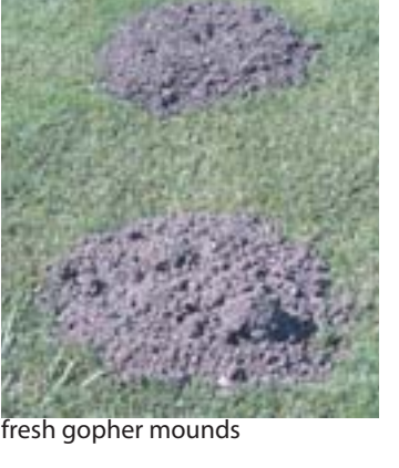
fresh gopher mounds

Question: I planted my roses but I read somewhere that roses should be planted in cages to prevent gophers from eating the roots and killing the plant. Should I dig them up and put them in a cage?