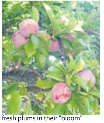
fresh plums in their "bloom"

In addition, I plant potatoes all year long and am always checking out our local nurseries to see what's in stock. If it's in the store, it usually means that it is the right time to plant it. What you'll find ripe and ready right now in gardens are plums, prunes, apricots, peaches, blackberries, and loquats in addition to all the nutritious and delicious summer vegetables such as heirloom tomatoes, peppers, beans, and cucumbers. Happy, healthy fresh eating to you!