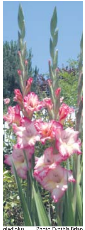
gladiolus