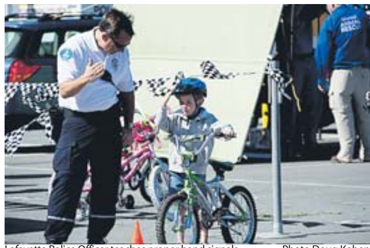
Lafayette Police Officer teaches proper hand signals