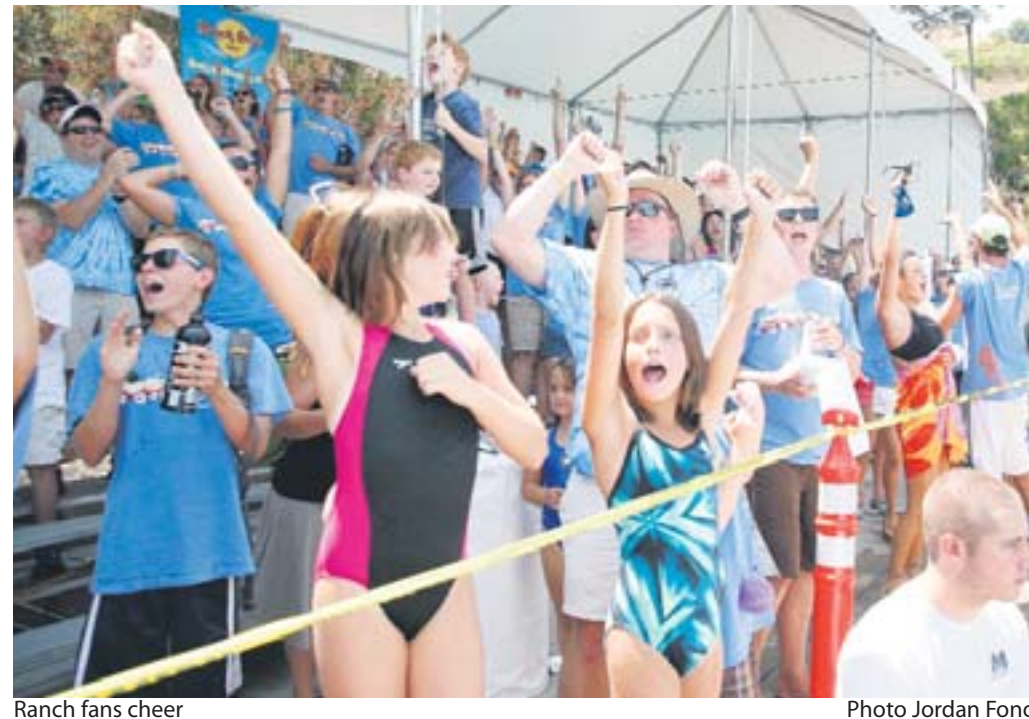
Ranch fans cheer