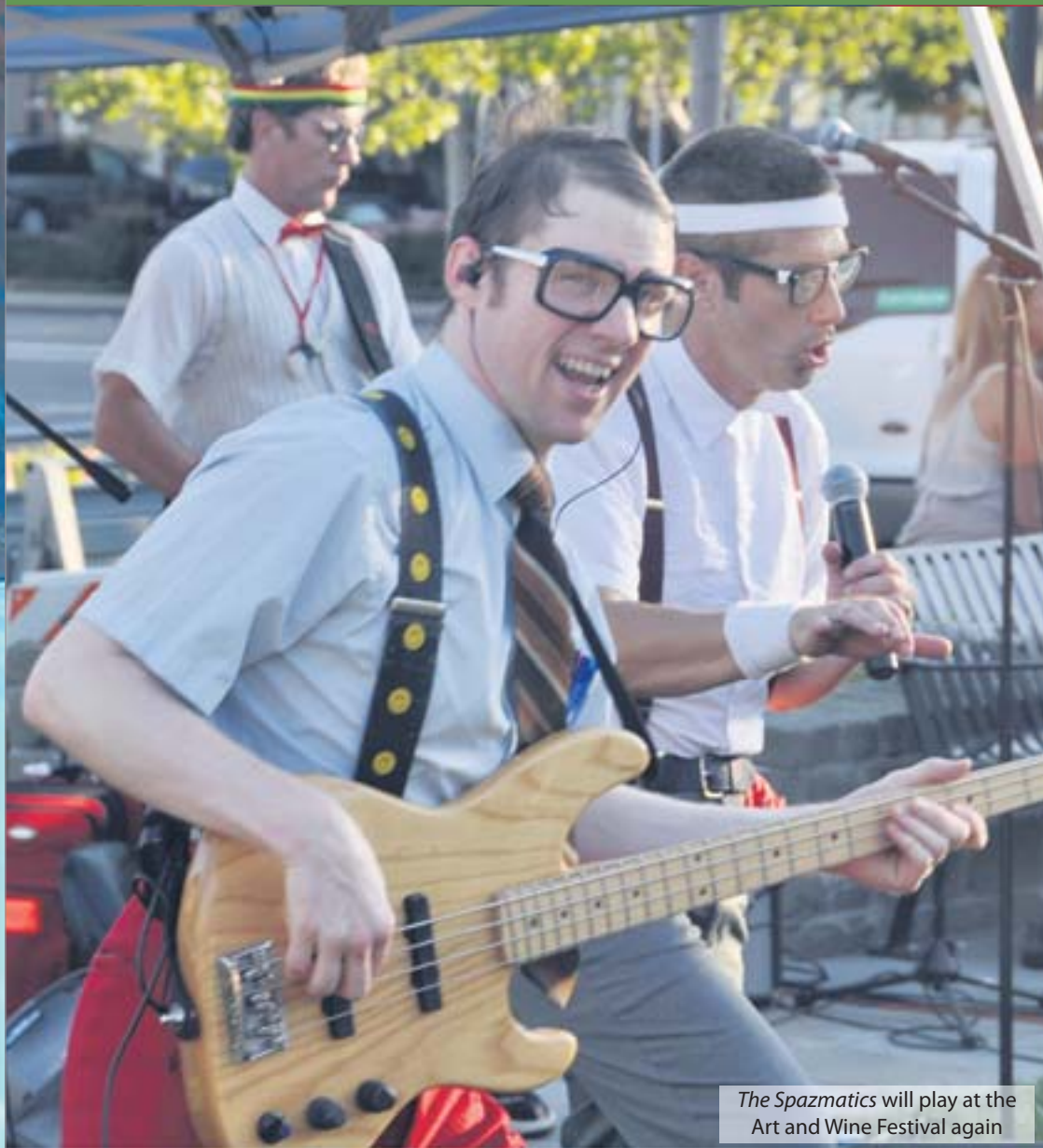
The Spazmatics will play at the Art and Wine Festival again

On September 19 and 20, Lafayette will hold its biggest event of the year, the Art and Wine Festival. A portion of Mt. Diablo Boulevard will be closed to cars, but open for strolling, drinking, munching and shopping – possibly even dancing.