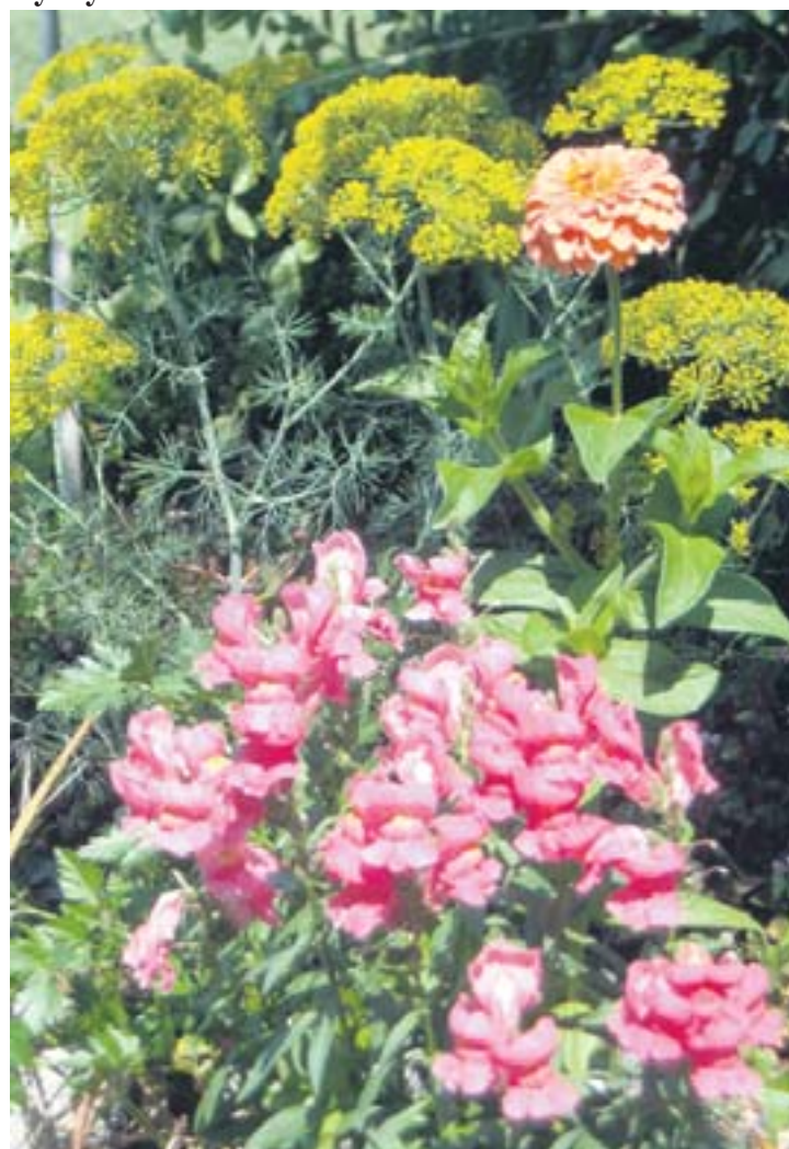
Mixed container of herbs and flowers: dill, parsley, basil, zinnia, snapdragon

Let's go into the backyard to admire the Naked Ladies," beckoned a male friend of mine. To the non-gardener, this sentence sounds like a racy pick up line, but to the avid gardener, these bulbous lilies in the Amaryllis family ( Lycoris squamigera and Amaryllis belladonna ) fill our senses with satisfaction. Watching these bodacious beauties sway in the breeze is intoxicating.