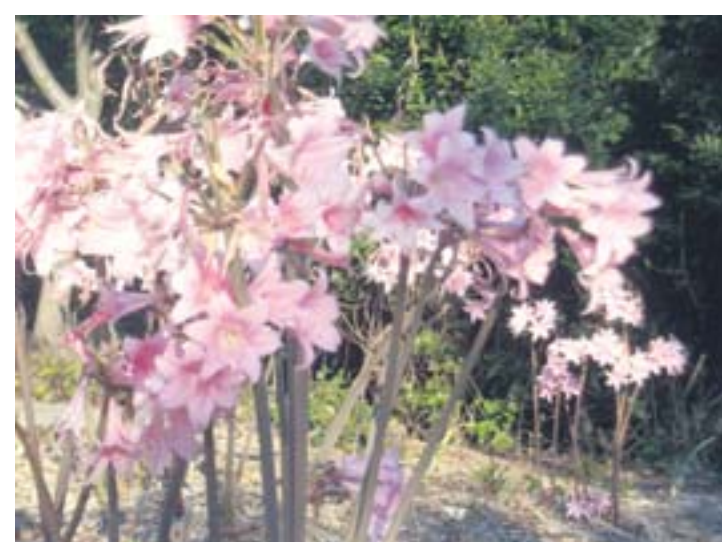
Naked Ladies