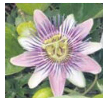
Passion Flower