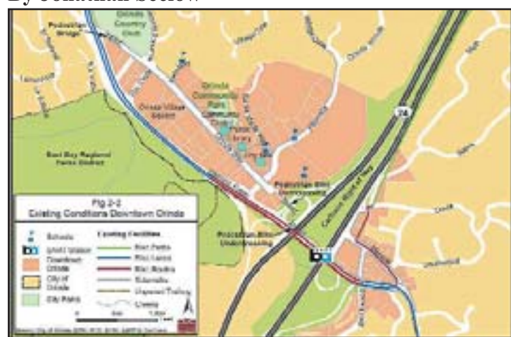
Figure 2-2: Existing Conditions Downtown Orinda