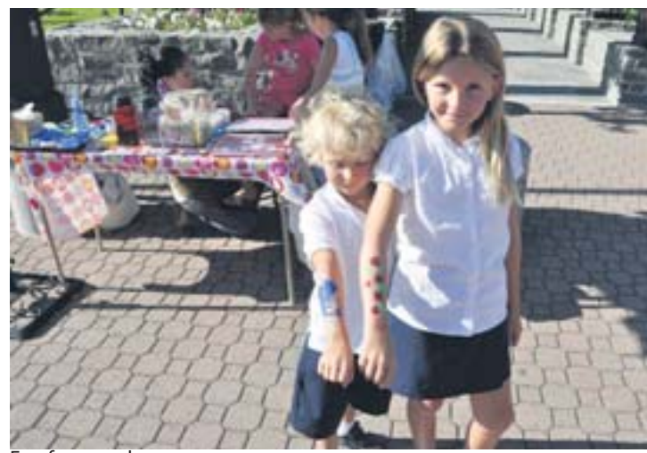
Fun for non-shoppers