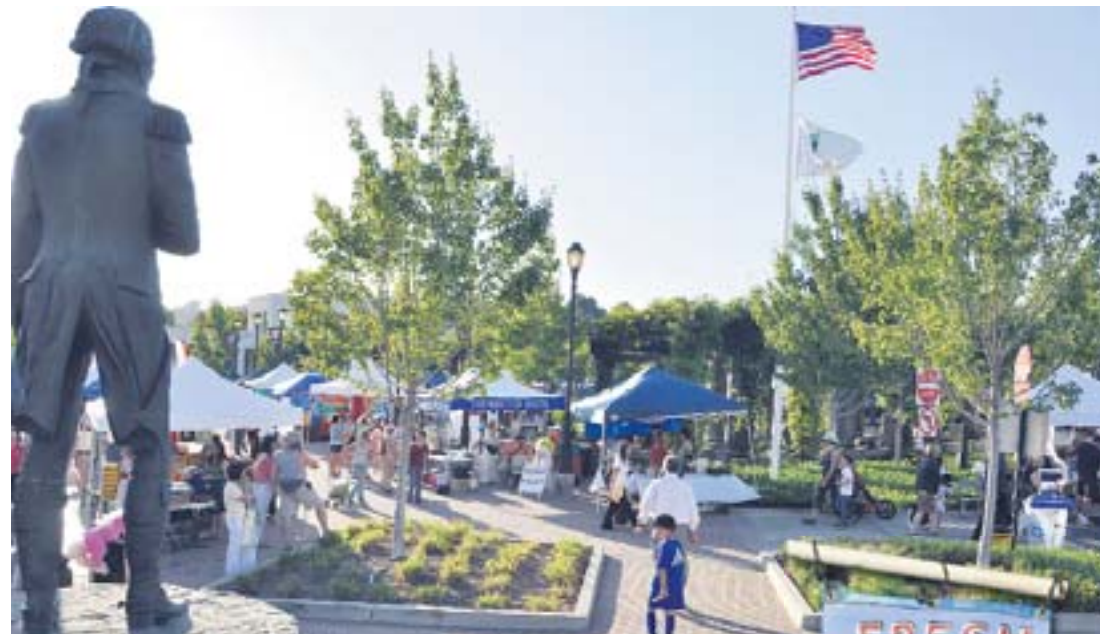
Lafayette Farmer's Market last Thursday