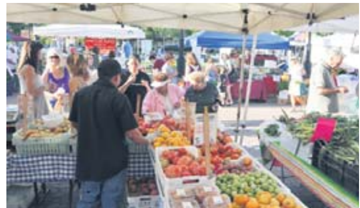
Shoppers enjoying a taste of fresh local produce.

The second Market on September 10 experienced some heat; 103 degrees, by some reports. That, along with a well-attended affair at Acalanes High School, may have kept the count lower. One vendor was a conspicuous no-show when its delivery truck had problems getting to Lafayette, leaving a gaping, gopher-like hole between the onion farmers and bee keepers. "Growing