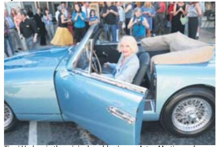
Tippi Hedren in the original sea blue/green Astin Martin used in The Birds

B irds can attract a crowd in Orinda. Almost every one of the 750 seats in the Orinda Theater was filled on Friday, September 18th for the screening of the Alfred Hitchcock thriller, The Birds . ... continued on page 4