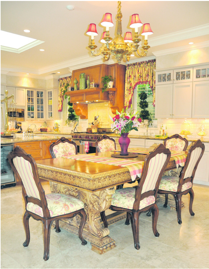
Antique dining table and chandelier from Munich in the foreground of Lintner's kitchen