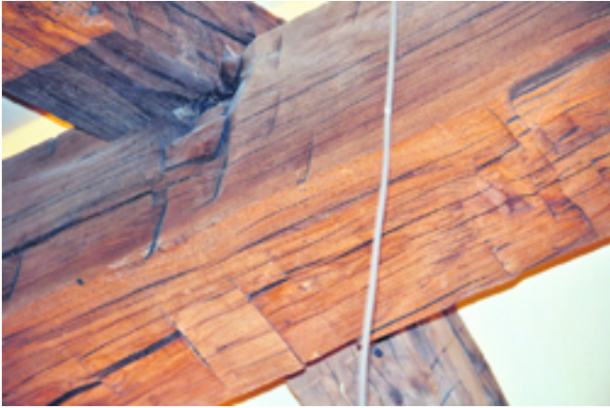
100-year old reclaimed wood ceiling beams in Sawczuk's kitchen