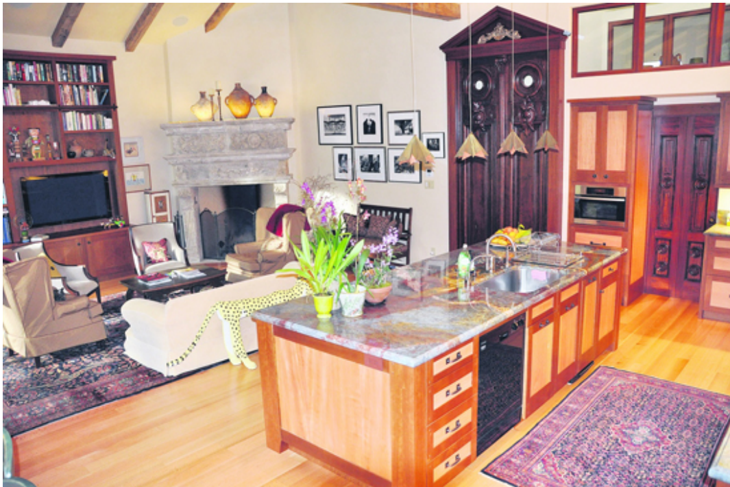
Sawczuk's kitchen island and family room