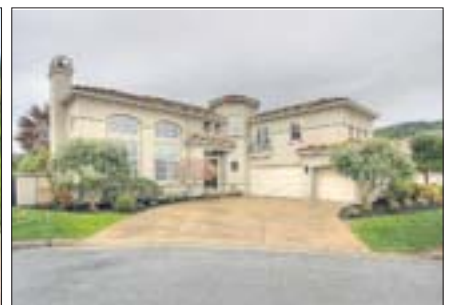
Moraga $1,695,000 3/3.5