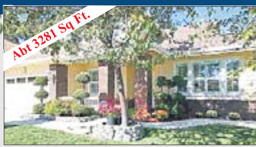
100 McMahon Court, Martinez $949,000