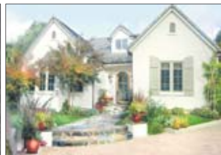
Lafayette $2,495,000 5/3.5