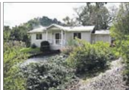
Lafayette $729,000 2/2