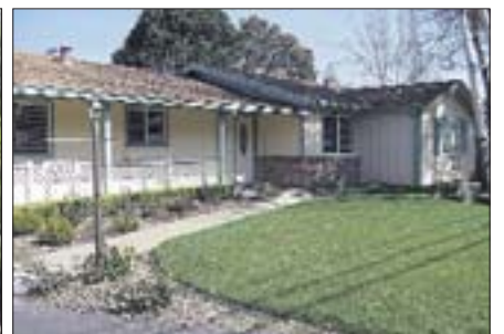
Moraga $699,000 4/2

5 Moraga Way | Orinda | 925.253.4600 • 2 Theatre Square, Suite 211 | Orinda | 925.253.6300