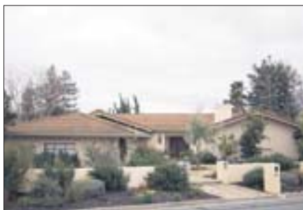
Moraga $1,050,000 3/2.5