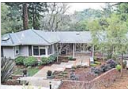
Orinda $1,050,000 3/2