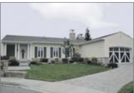
Orinda $1,295,000 3/2.5