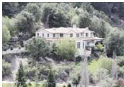
Orinda $3,095,000 5/4.5

Coldwell Banker takes your home global with it's award winning websites