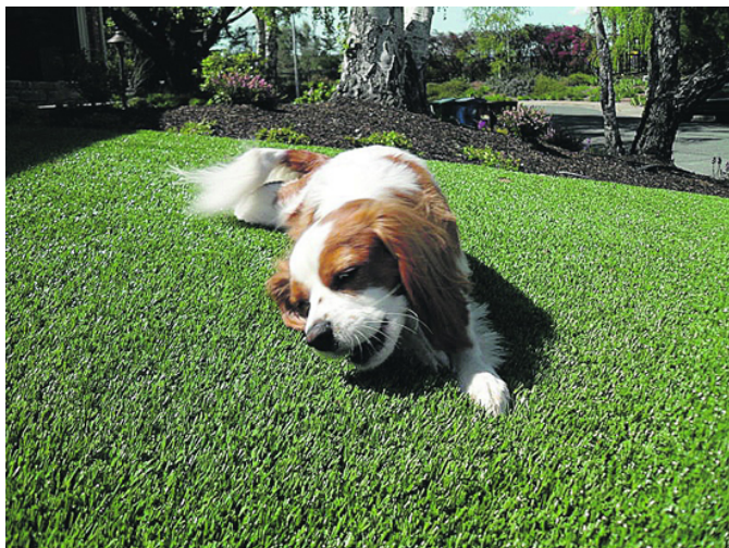
A puppy enjoying his brand new synthetic grass

Is it real or is it plastic? That perfectly green stuff sprouting up in Lamorinda yards may not be grass, but plastic. Nothing like lying on a lush green carpet of polyethylene and nylon to watch the clouds roll by.