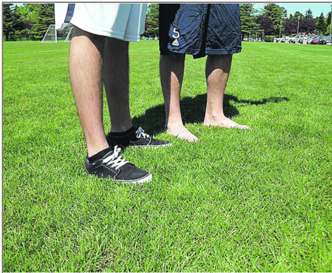
Real grass still tickles feet at Saint Mary's College