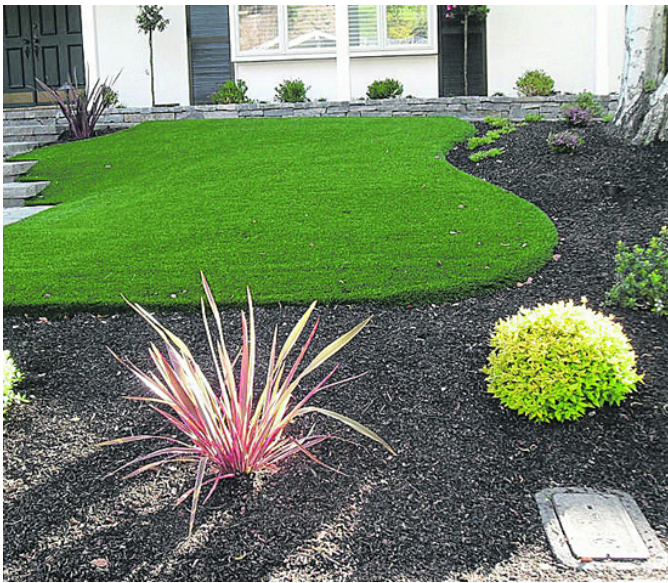
Front yard with synthetic grass