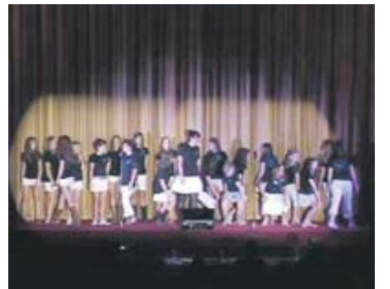
The OAC's annual Orinda Idol competition has drawn enthusiastic participants throughout Lamorinda, including this middle school group of finalists from last year's competition.