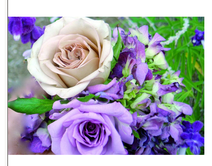
Close up of bouquet of sterling silver, and copper colored roses, lavender hydrangea and Russian purple sage.