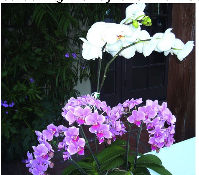
Dendrobium orchid color combo creates elegant simplicity.

"For colors, we request raspberry and cream with a hint of dirt. For the ceremony, forty corsages and boutonnieres, six bridal bouquets, two chocolate baskets festooned with satin ribbons filled with magenta rose petals, and forty- five table arrangements...all organic from your garden, please." That was the order for my floral services for a recent nuptial. Okay! Got it! Done!