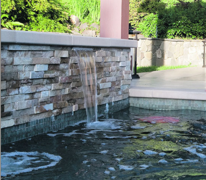
Water fall feature