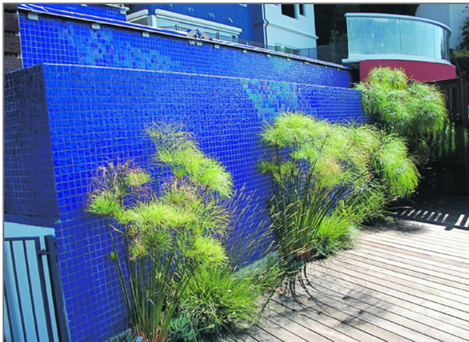
Waterfall on 8' supporting wall