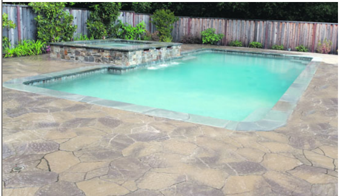
Added raised spa with three waterfalls