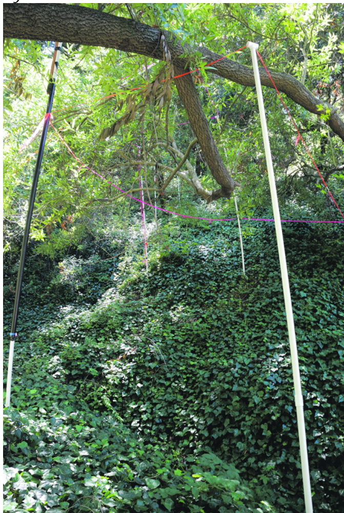
19 La Encinal with story poles

At its July 20th meeting, the Orinda City Council voted unanimously to support the Planning Commission's decision to deny the request of the owners of 19 La Encinal to construct a new 3,700 square foot single-family home with a 2-car attached garage and elevator. The impact of the proposed home, which has an aggregate building height of 54 feet, on the neighborhood and the creek that traverses the property were the primary reasons for its decision. The Planning Commission had previously denied a larger home design, slightly over 4,300 square feet, in January.