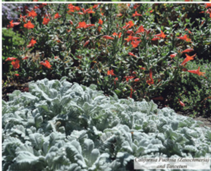
California Fuchsia (Zauschneria) and Tanacetum