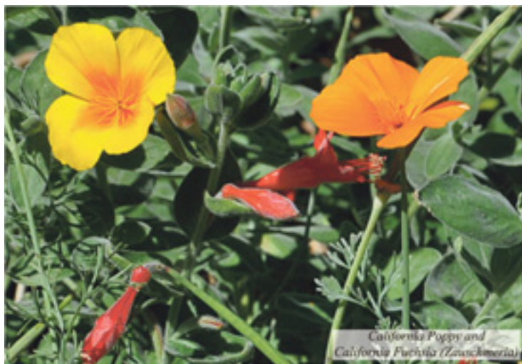
California Poppy and California Fuchsia (Zauschneria)