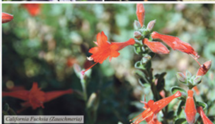
California Fuchsia (Zauschneria)