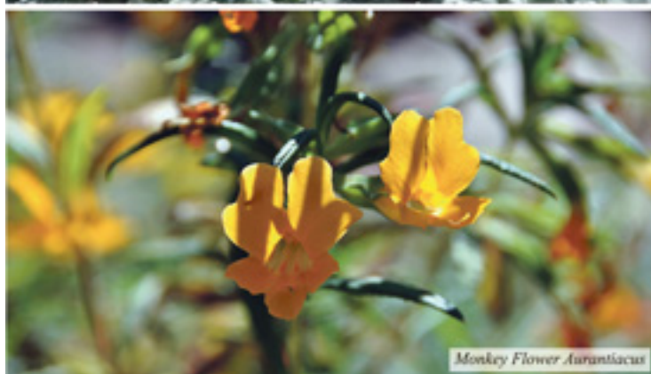
Monkey Flower Aurantiacus