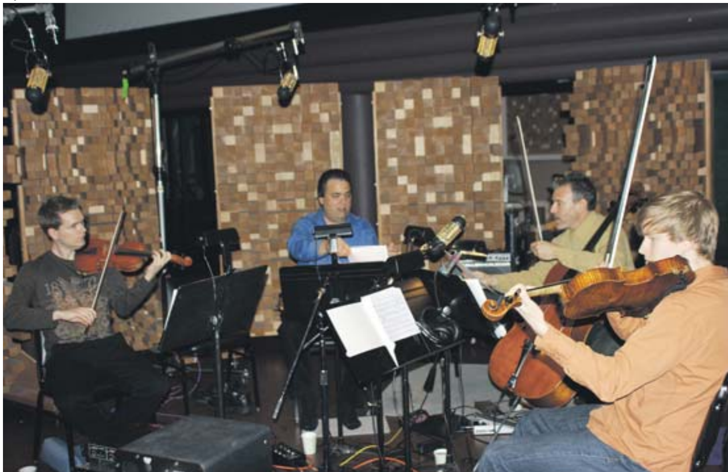
Turtle Island Quartet rehearses during a recording session for "Have You Ever Been...?"